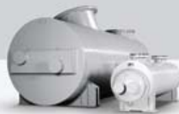
ES extended surface

The industry leader for intercooler and aftercooler performance. Our unique compact plate fin design provides superior cooling of large air volumes at low pressure drops, which means less energy consumption.