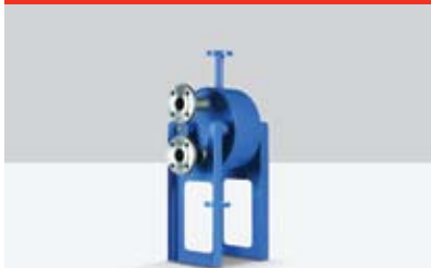
SIGMASHELL plate and shell

Unique combination of a high pressure shell and a compact, high-efficiency laser welded plate pack. Shell side closures can be all welded or removable for visual inspection and cleaning. Flexible connection sizes also make it ideal for gas phase applications.