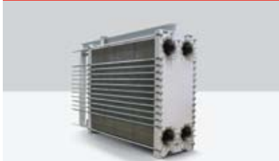
SIGMA gasketed plate and frame

Proprietary, high-efficiency corrugated plates resulting in the highest overall heat transfer rate by assuring highly turbulent flow and excellent fluid distribution across the entire surface.