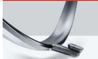
SIGMAFIX mechanical gasket

Glue-free gasketing system allows for quick and easy gasket replacement through laterally built-in mounting clips.